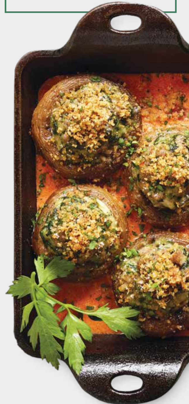
THREE-CHEESE & SAUSAGE STUFFED MUSHROOMS

Stuffed with sausage, spinach, ricotta, romano, mozzarella and Italian breadcrumbs served over our tomato cream sauce (300 calories) | 6.79