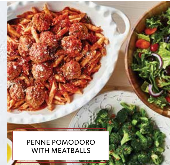
PENNE POMODORO WITH MEATBALLS

PENNE POSITANO PENNE POMODORO WITH MEATBALLS OR MEAT SAUCE