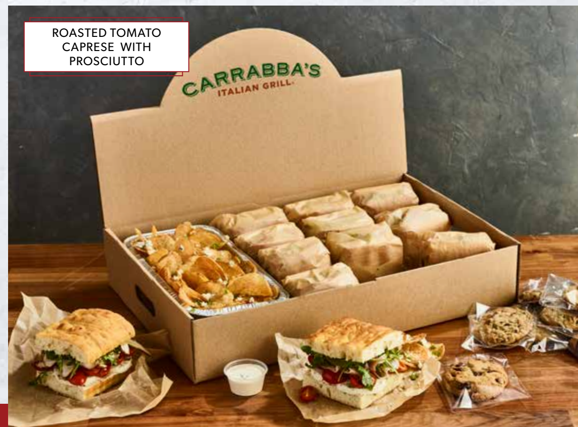
ROASTED TOMATO CAPRESE WITH PROSCIUTTO

ROASTED TOMATO CAPRESE WITH PROSCIUTTO OR CHICKEN, ITALIAN OR A COMBINATION OF ANY TWO