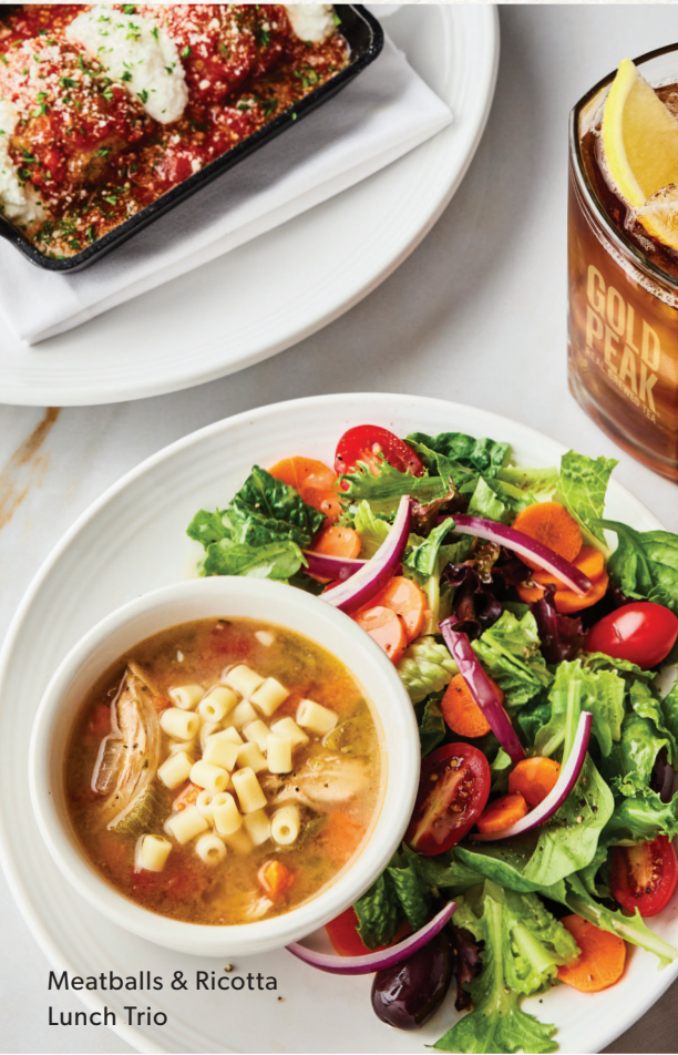
Meatballs & Ricotta Lunch Trio